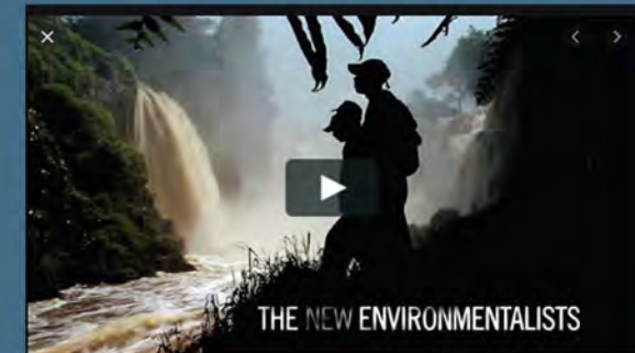
"The New Environmentalists"