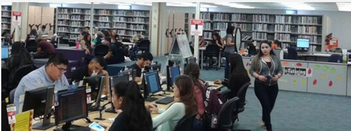
Pecan Campus Library