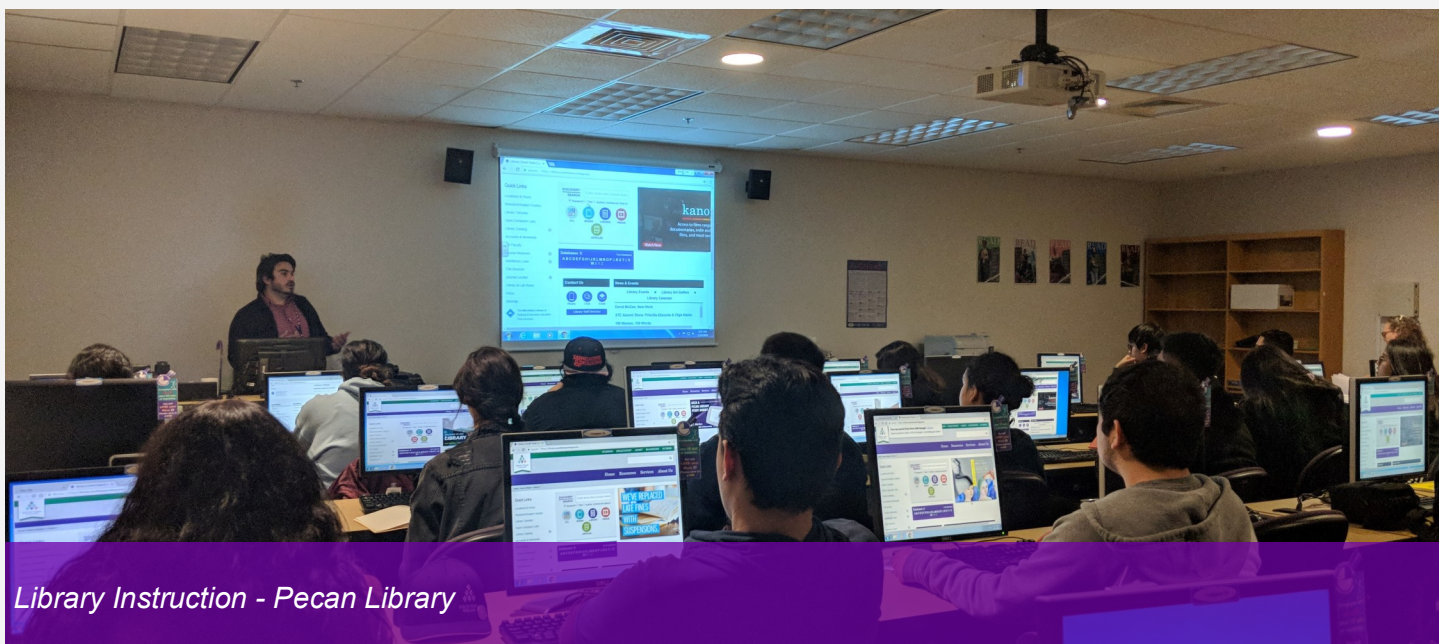
Library Instruction - Pecan Library